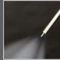
Auto Shut-Off Steam Wand