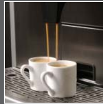
Consistent Shot Delivery