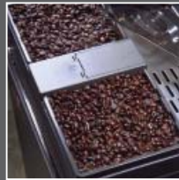
Dual Bean Hoppers