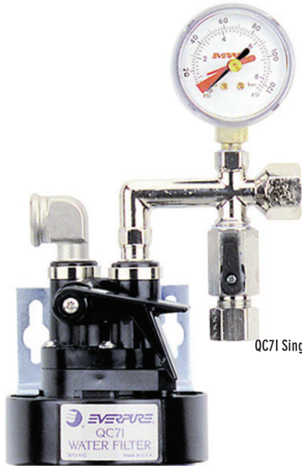
QC7I Single Head: EV9272-41

Filter head exclusively for Everpure replacement cartridges