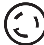
Nema L6-30 Twist