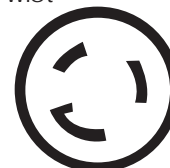
Nema L6-30 Twist